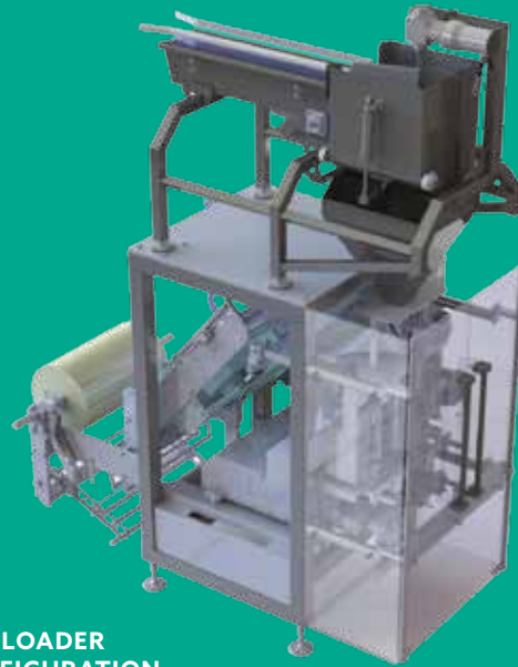
BAG LOADER CONFIGURATION