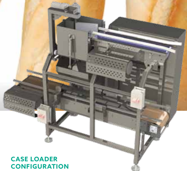
CASE LOADER CONFIGURATION

Robust and advanced system designed to count and collate singulated products